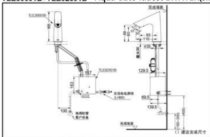
TLE30001B+TLE02501B Aqua-auto faucet EWATER(single)

TOTO(CHINA) CO.,LTD. All rights reserved.